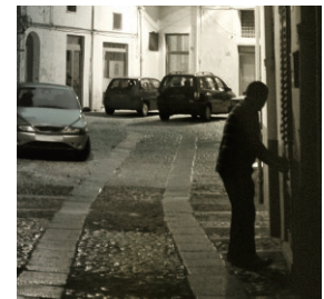
AG Neovo SX-Series