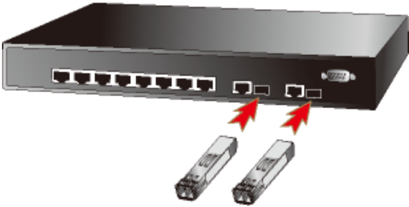
Figure 1: Plug-in the SFP transceiver

Note: Before connecting the other switches, workstations or Media Converters ensure the following conditions are met.