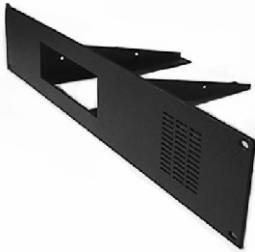
RM-1935 RACK MOUNT ASSEMBLY 19" W x 3½" H

Louroe can fabricate 19" rack mount assemblies for all of its desktop audio base stations and audio-follow-video switchers. Standard dimensions are 19"W x 3½"H for all base stations and switchers except for Models AP-12TB, AP-16TB, AVS-4A and AVS-8A which require a 19"W x 7"H rack mount.