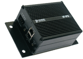
IF-PX AUDIO INTERFACE ADAPTER