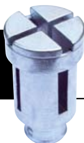
Wire & chain adapter included.

Versatility comes from the unique adapter heads that are specific to each application.