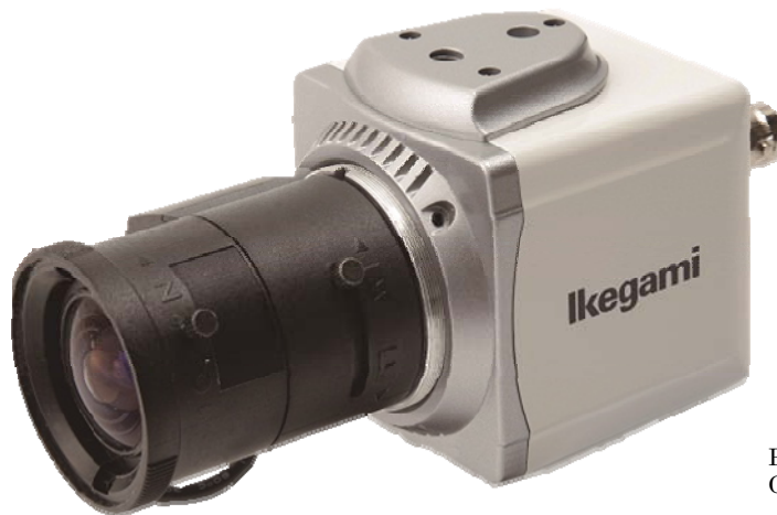
Pictured with Optional Lens