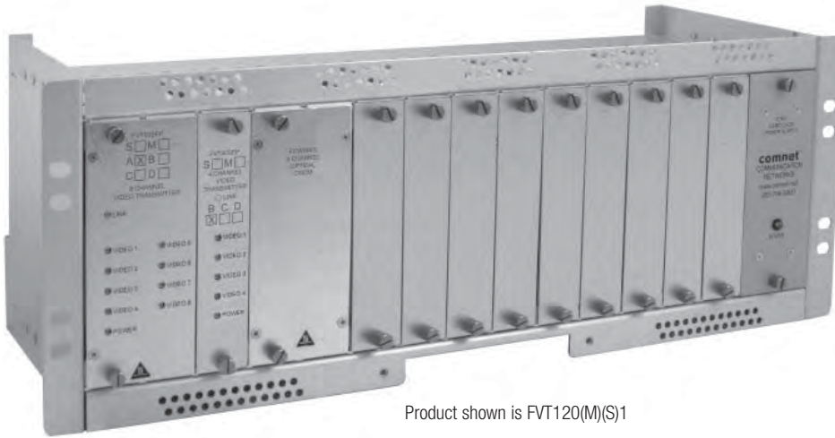
Product shown is FVT120(M)(S)1