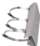
W-DS-1275ZJ Vertical pole mount