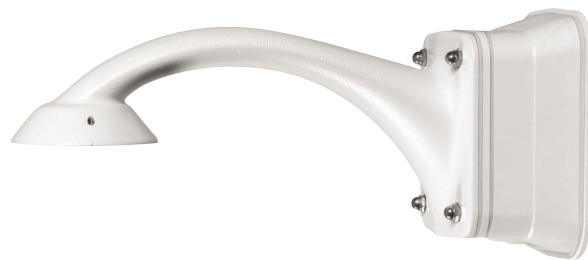
Integrated pendant arm