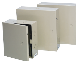
Indoor Power Supply Boxes