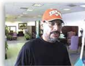
Actual Robbery Image

Law enforcement agencies will appreciate the up-close and high-detail images captured by the IRIS Sign and Tower Cameras.