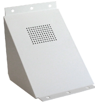
TLSP CORNER MOUNT

Federal Law References: Federal Regulations, US Code, Title 18. Crime and Criminal Procedure, Sec.2510.