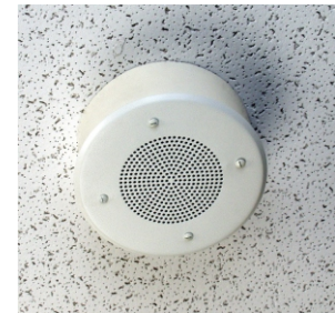
MODEL TLM-CS SPEAKER/MICROPHONES CEILING MOUNT SURFACE