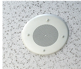
MODEL TLM-CF SPEAKER/MICROPHONE CEILING MOUNT FLUSH