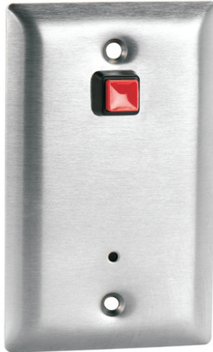
DCS-1 REMOTE CALL STATION