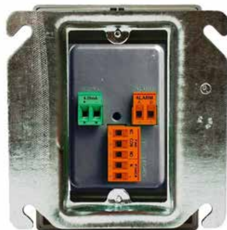
12-Series Rear View