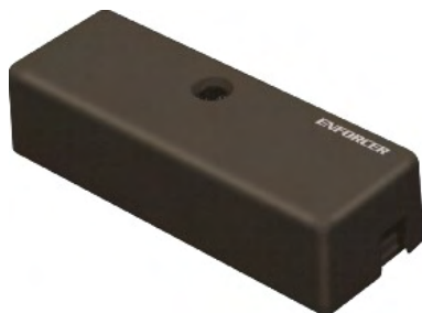
SS 040Q/BR Shown